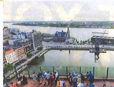
Left: the terrace of 't Zilte restaurant. Below: Antwerp's traditional architecture

As soon as you arrive in Seville, head to El Rinconcillo , the oldest tavern in the city, which dates back to 1670. Enjoy a plate of prawns and some calamari, along with a glass of sherry. Time for a spot of sightseeing, so up the Giralda Tower you go. The view from the top is stunning, with pretty terracotta roofs stretching for miles. Your quads get a workout on the way